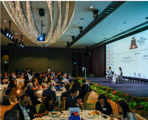
AmCham Balestier Series