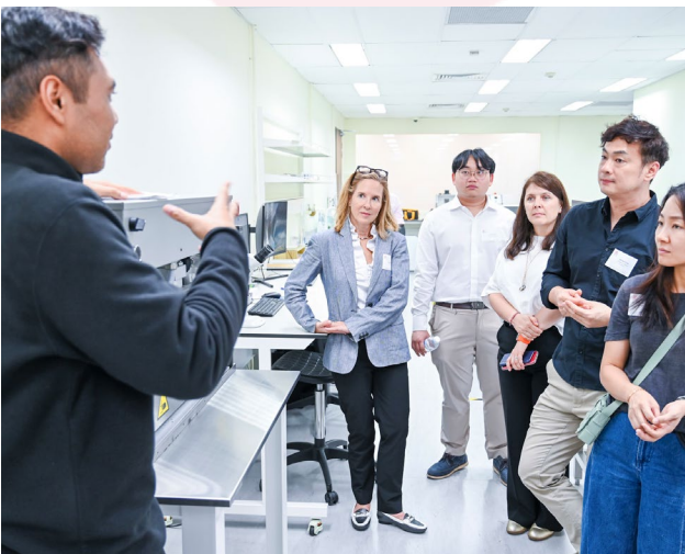
Tour of Oliver Healthcare Packaging Asia-Pacific Technical Centre