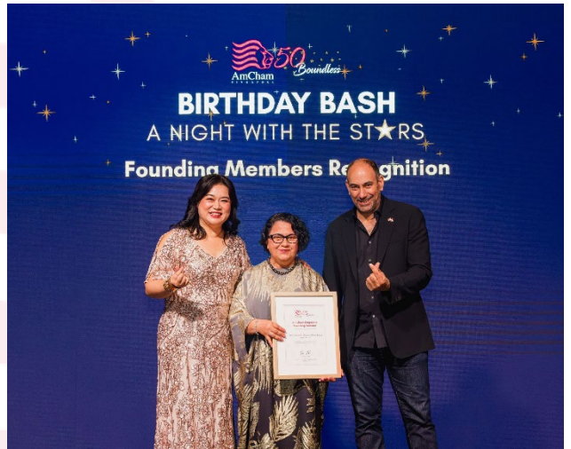
AmCham50 Birthday Bash