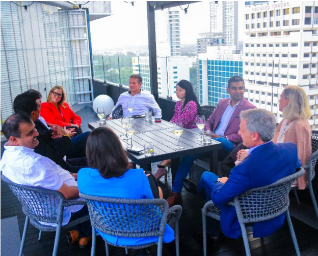
CEO Council Dinner with NVIDIA