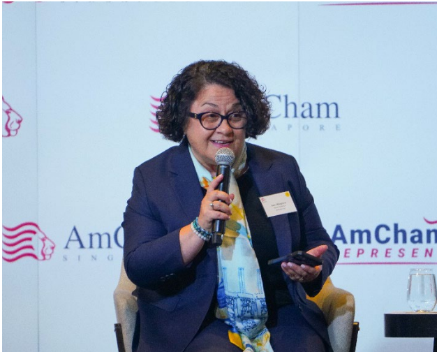
AmCham Regional Economic Conference