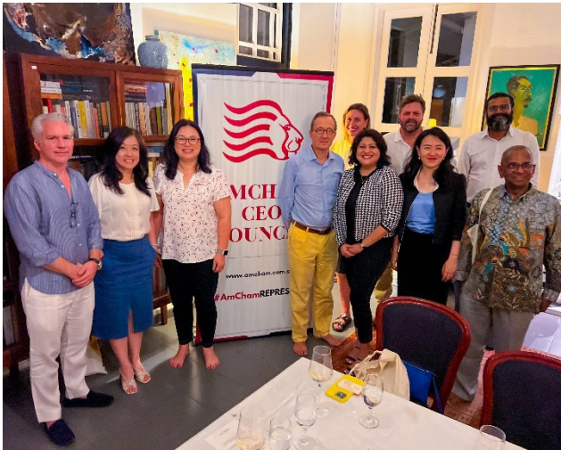
CEO Council Member-Hosted Dinner