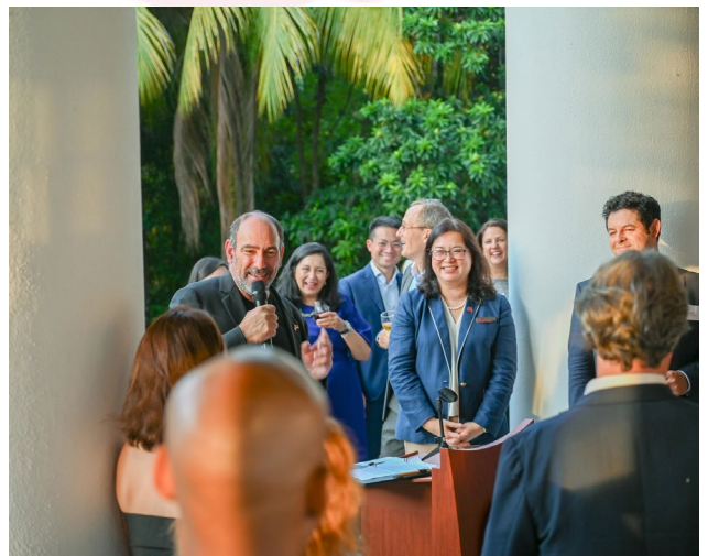
Regional Economic Conference VIP Reception