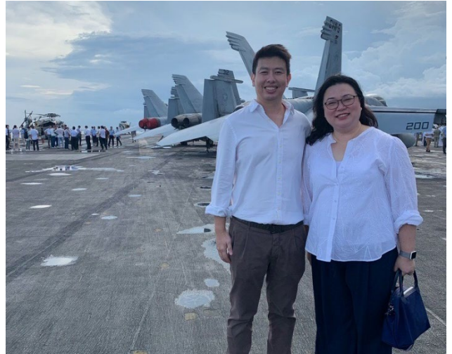
USS Ronald Reagan Reception