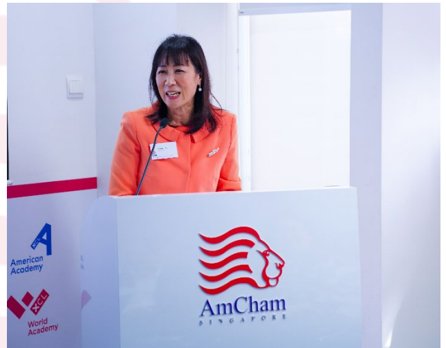
AmCham Women Elevate Symposium