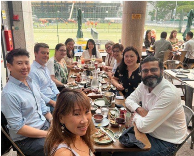
Board of Governors and CEO Council Reception with NCAPEC