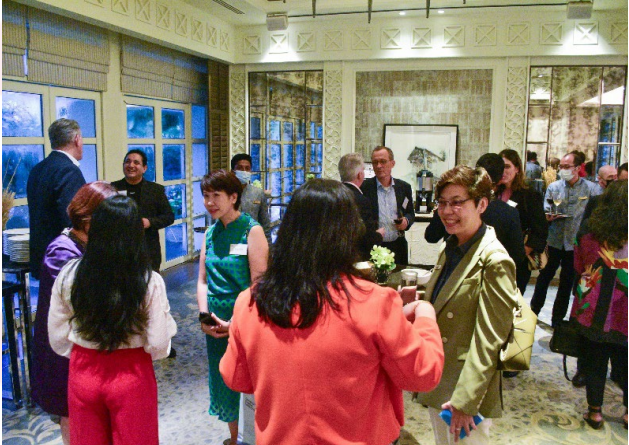
Board of Governors and CEO Council Year End Thank You Dinner