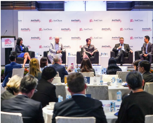
Human Capital Conference