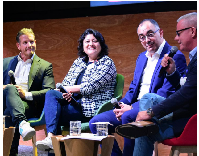
SME ACCelerate Forum