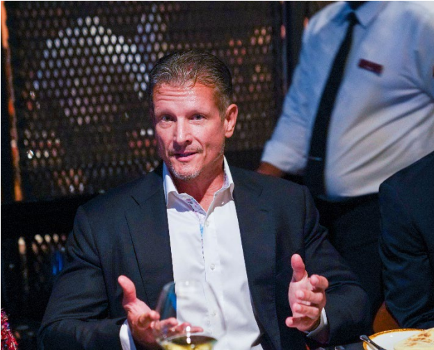
U.S. Congressional Staff Delegation to Singapore